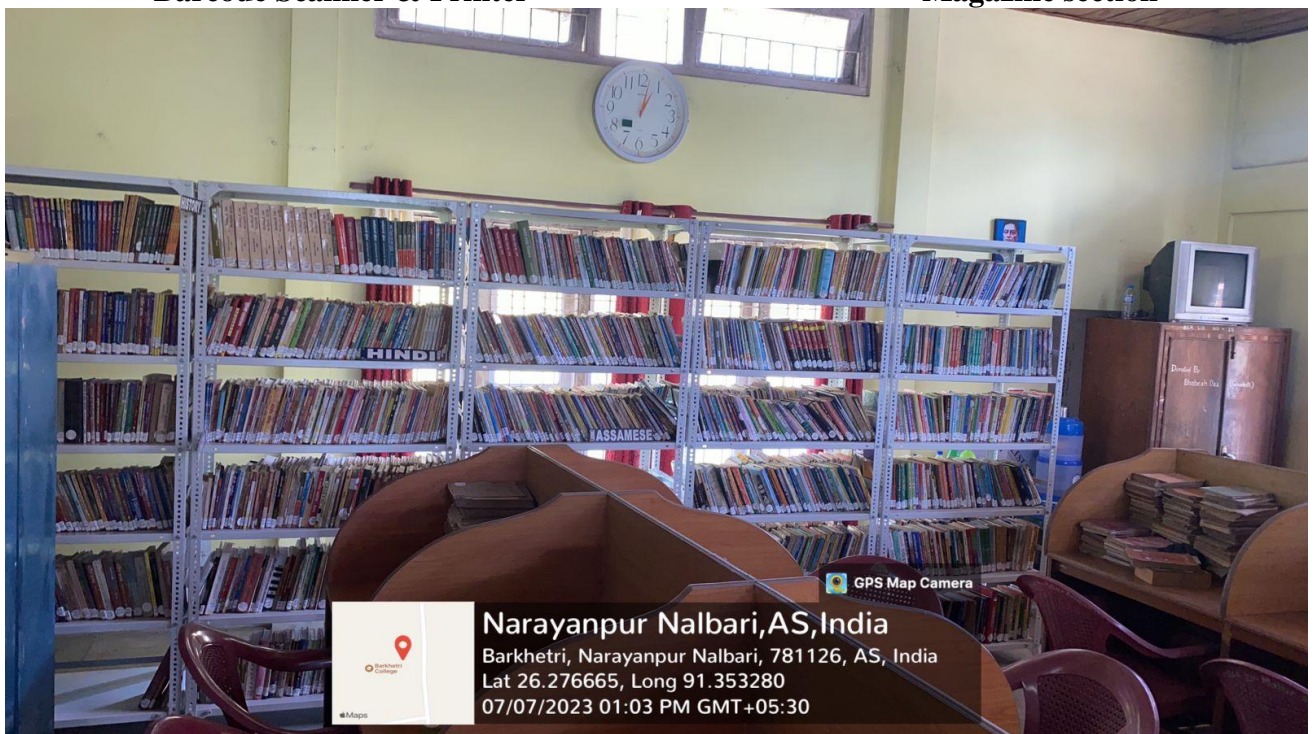
Book shelves and books