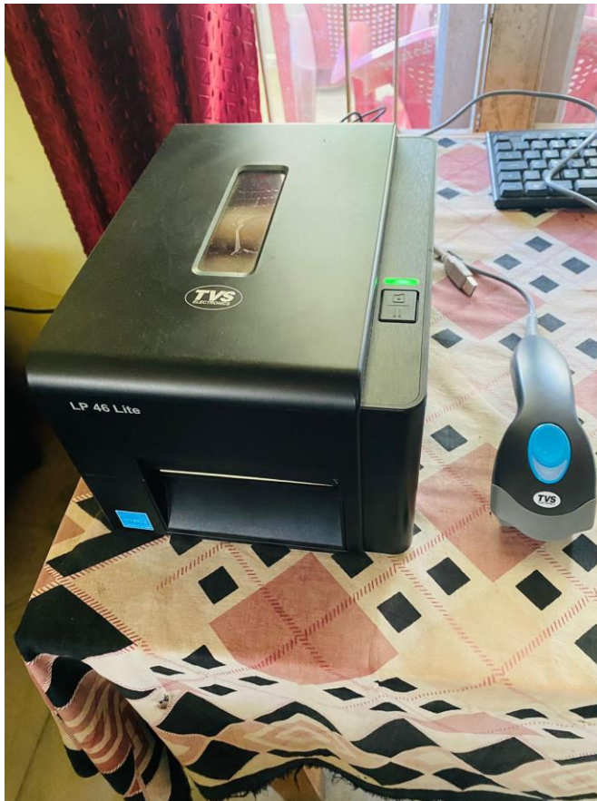
Barcode Scanner & Printer